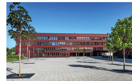
Konrad-Zuse-Haus at A.-Einstein-Str. 22