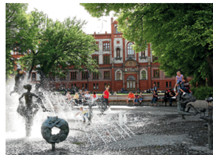
"Brunnen der Lebensfreude" and university main building at Universitätsplatz