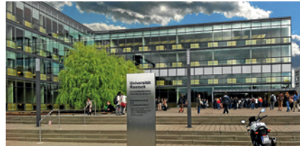
University library at Albert-Einstein-Str. 6