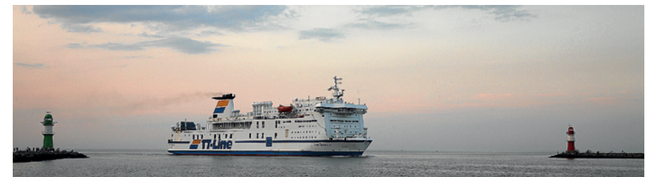
Warnemünde's harbor entrance