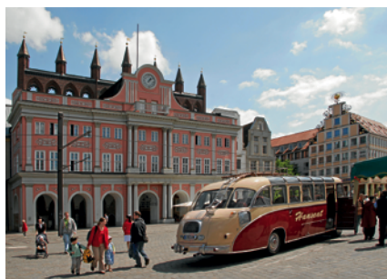
Town hall with historical sightseeing bus

If you use a bicycle, you are legally required to have a working light, bell and brakes. It is a good idea to invest in a good bike lock.