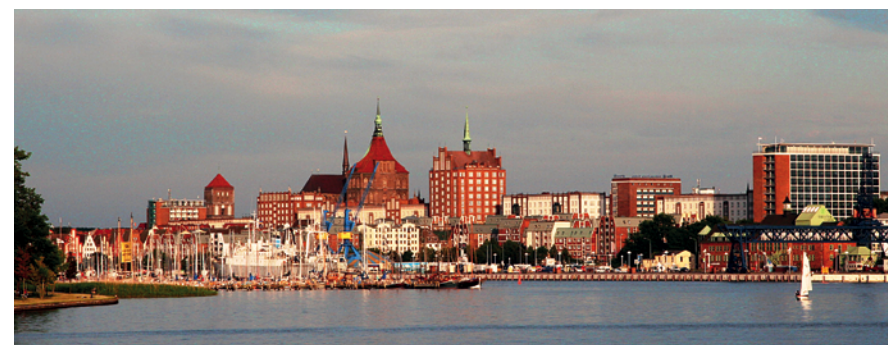
View on the city of Rostock from the river Warnow