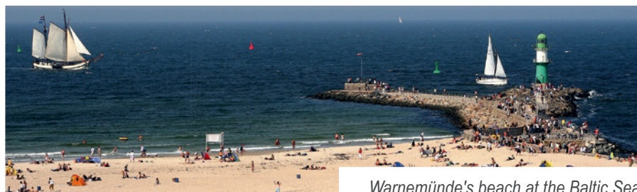
Warnemünde's beach at the Baltic Sea

Please note: The dates and dates apply to normal operation. Due to the corona pandemic, there are dynamic changes. Please inform yourself on the web.