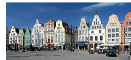
Market square "Neuer Markt"