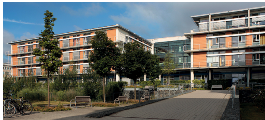
University hospital at Schillingallee

To call telephone numbers to outside the university, dial "0" before the telephone number, e.g. instead of 112 → 0 112.