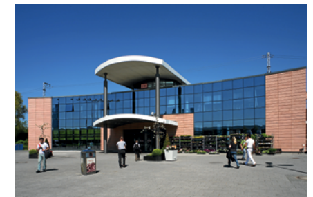
Rostock main station – southern building