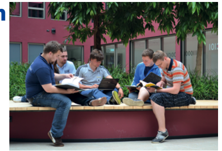
Mentoring group in the Konrad-Zuse-Haus

The mentoring groups are formed at the beginning of the semester and meet at regular intervals to discuss any questions you might have, and to get to know each other